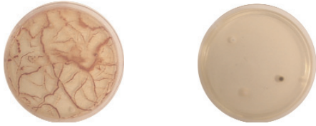
Before and after bacteria samples application of BOS unit to commercial dumpster compactor